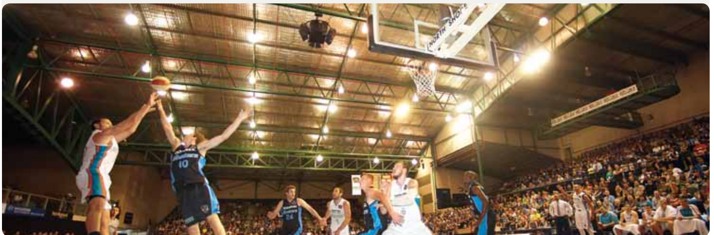
Power in the community: the Breakers basketball team in action at the North Shore Events Centre.

The costs of the market operation service providers, the Electricity Authority, and the energy efficiency and consumer switching activities are funded through the Electricity Industry Levy which is set out in Government regulations. The levy is paid by companies generating, retailing or distributing electricity. The costs of the levy are passed to consumers through the prices charged by retailers.